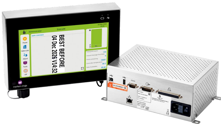
SmartDate® OEM Connect with the optional Remote User Interface (RUI)